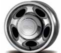
16-in. Aluminum Wheels Available