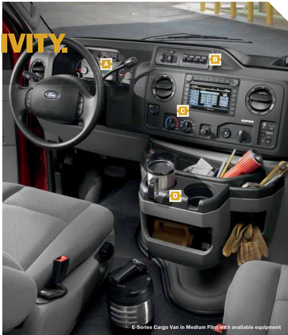
E-Series Cargo Van in Medium Flint with available equipment

This standard feature gives you lots of storage capacity within easy reach. The upright storage bin is large enough to hold clipboards or even some laptops.