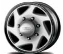
16-in. Steel Wheels with Sport Wheel Covers Standard

Power Code is a trademark of Code Systems, Inc.