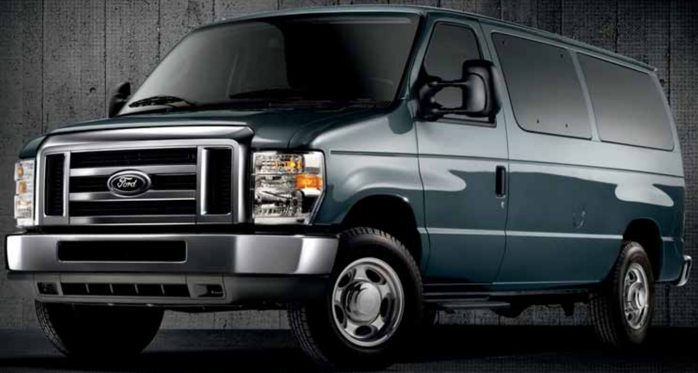
E-150 XLT Premium 7-passenger Wagon in Steel Blue with available equipment

1 Passenger and cargo capacity limited by weight and weight distribution. 11-, 12-, 14- and 15-passenger vehicles may be classified as buses and may require appropriate licensing.